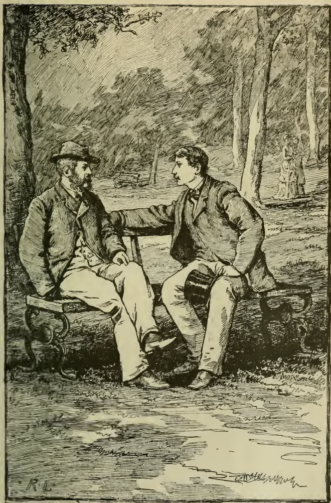
On Boston Common.